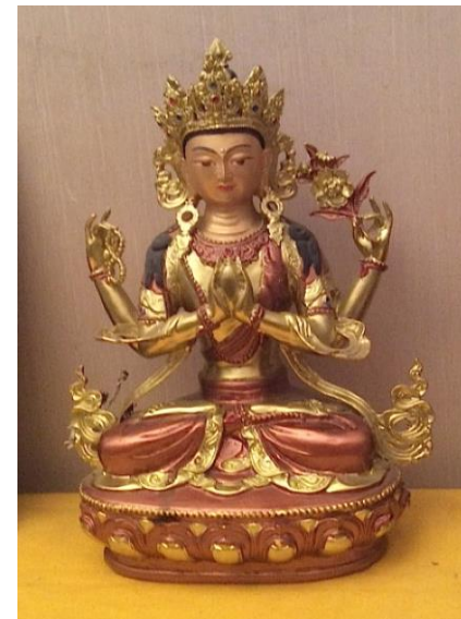
Statue offered to Chongren