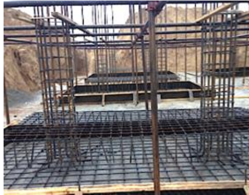
2 nd floor floor, fully financed by Chongren

The quality is really outstanding for local conditions, modern, safe (to withstand earthquakes up to 8 on the Richter scale) and functional for teaching.