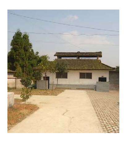
The toilet-janitor building