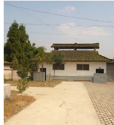
The toilet-janitor building