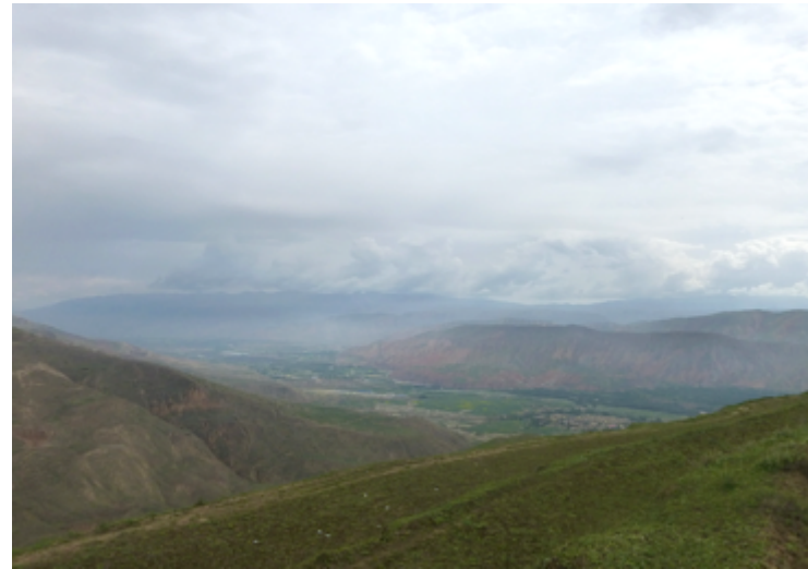
The old school, on the other side of the valley