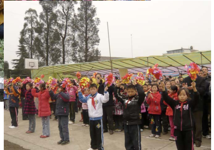
Students look forward the new school buildings