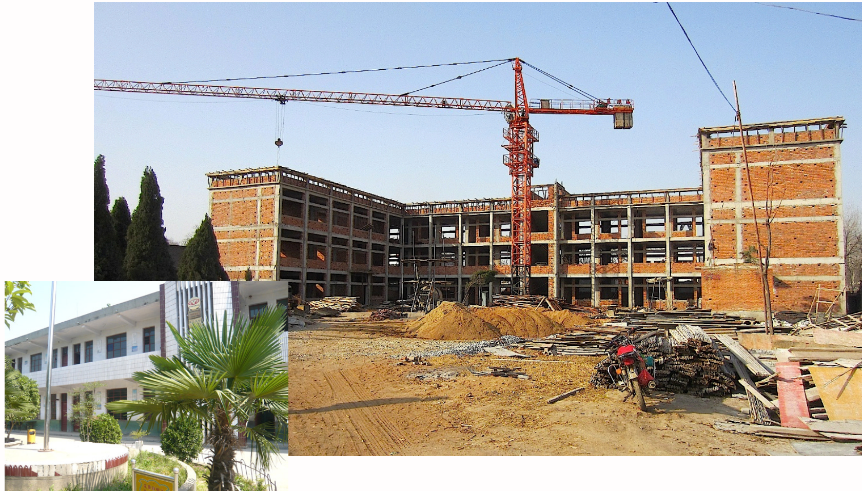
The old school building, August 2012

An impressive, modern school U-shaped school complex that will offer space for more than 300 students, including around 100 boarding places.