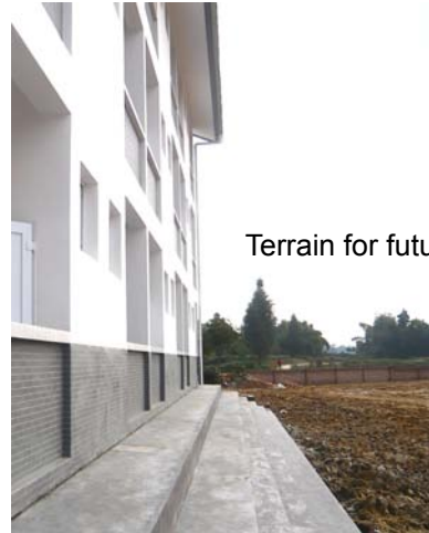
Terrain for future sports ground