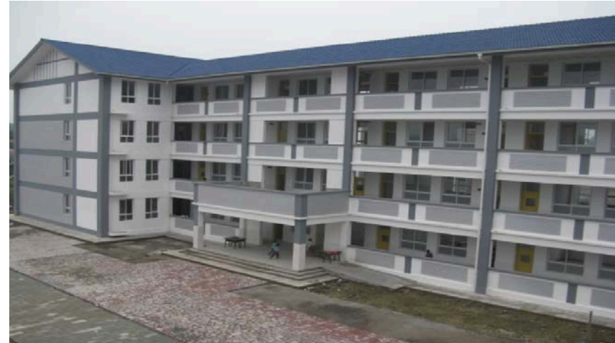
..and on the opening day, November 5, 2010