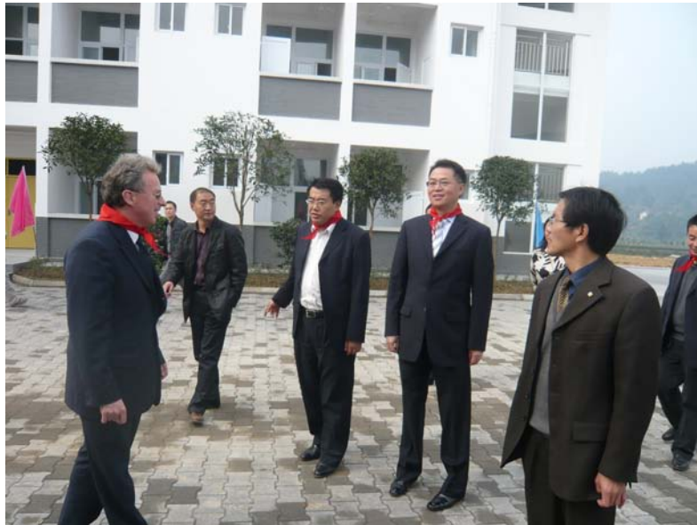
The donors inspecting the new complex on November 5