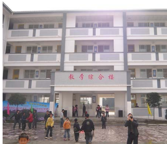
One day before the opening