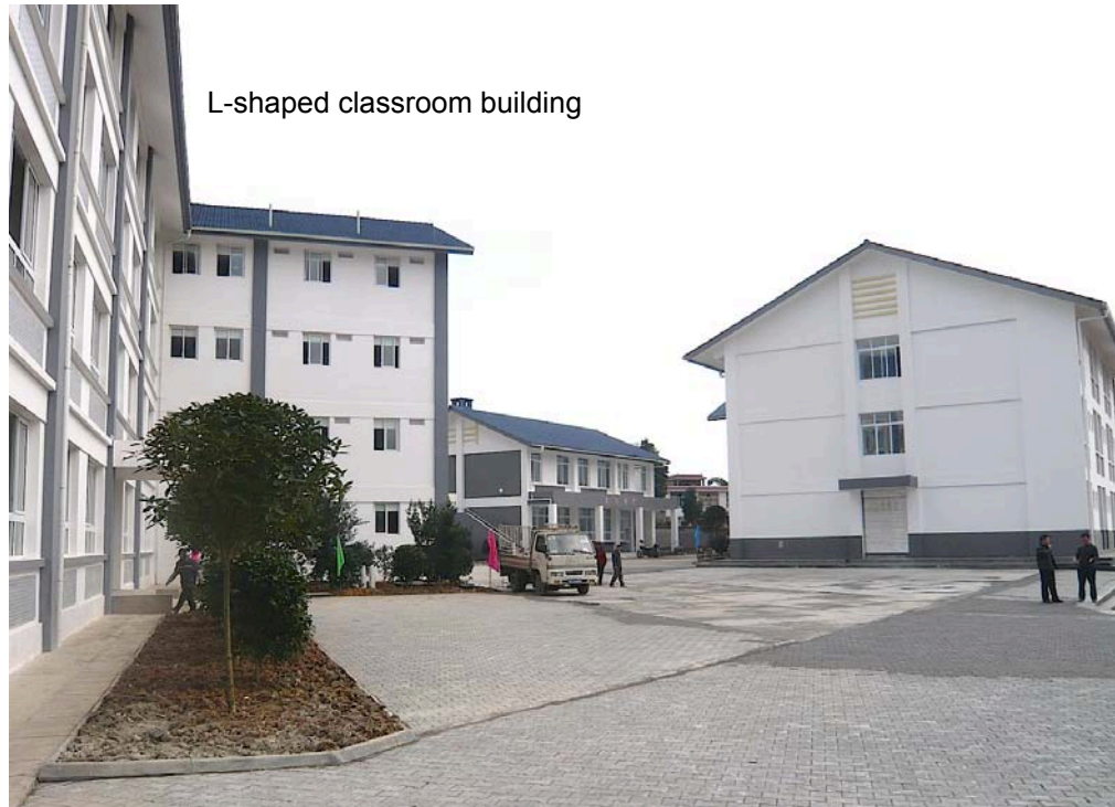
L-shaped classroom building