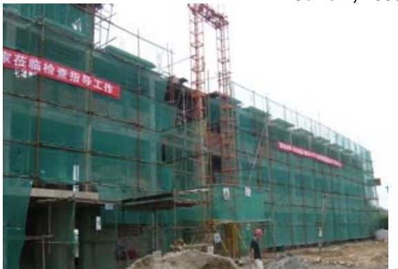
July 3, 2009