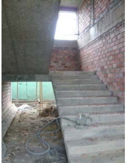
July 3, 2009