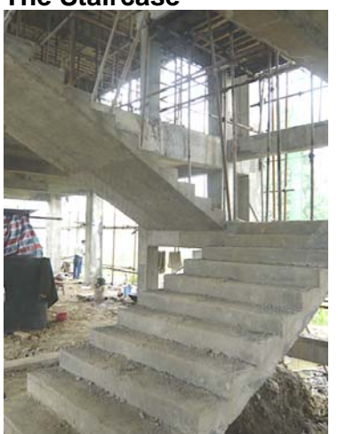
June 1, 2009