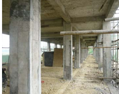
June 1, 2009