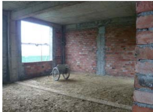
July 3, 2009