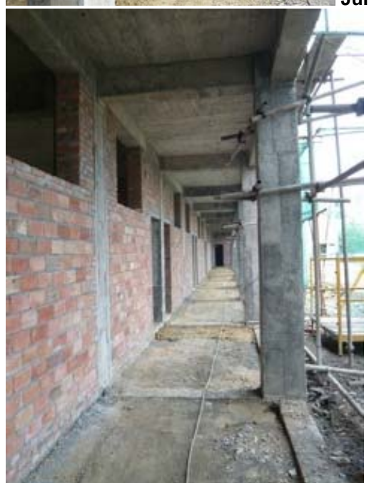
July 3, 2009