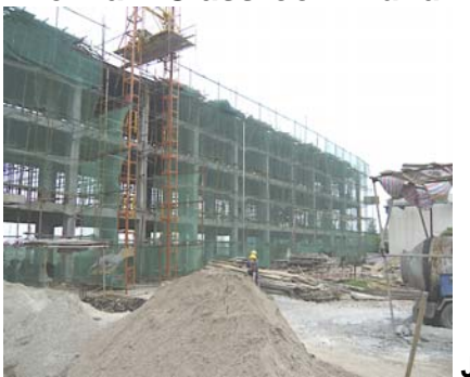
June 1, 2009