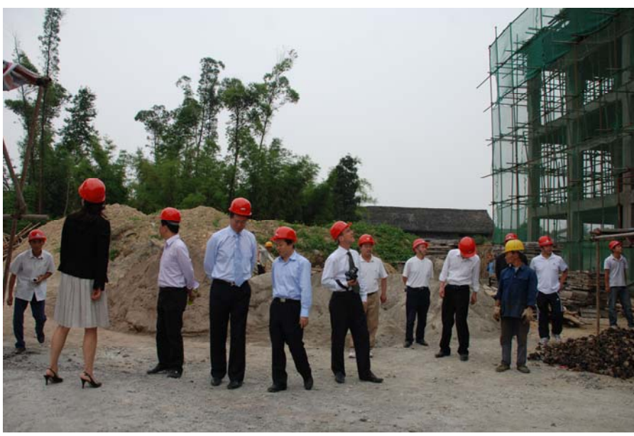
Progress inspection of the Lianjiang Central Primary School Project